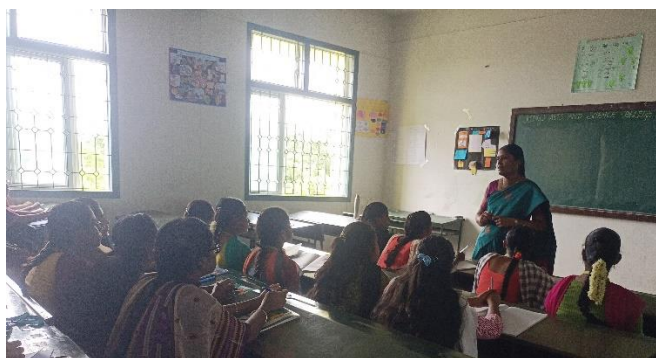
FDP entitled "Unlocking Success: SET and NET Exam Workshop Overview" organized by Department of Biotechnology was held on 29.08.2024.