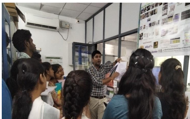
Educational Visit to Salim Ali Centre for Ornithology and Natural History (SACON) was organized for the II M.Sc. Biotechnology students on 24.09.2024.