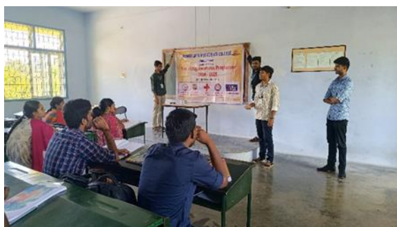
Anti-Drug Awareness Programme was organized at Kongu Arts and Science College (Autonomous), Erode on 24.09.2024.