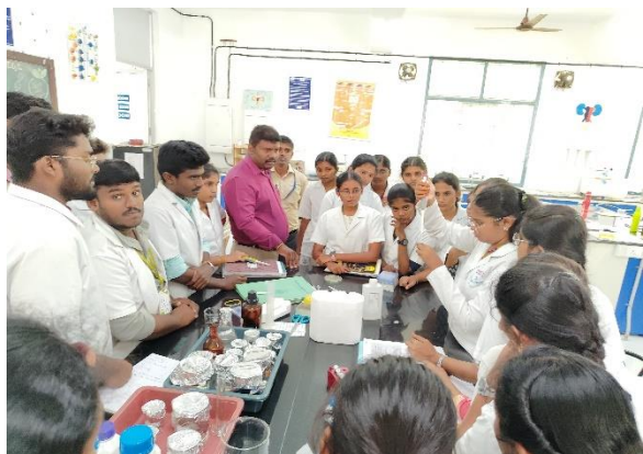
Hands-on Training on Innovations in PCR and Fermentation organized by Department of Biotechnology was held on 20.09.2024 and 21.09.2024