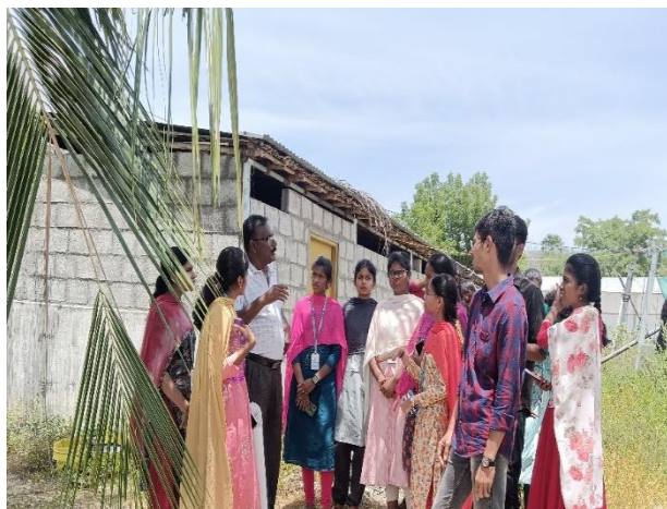
Educational Visit to Banana Forest was Organized for the UG students of Department of Biotechnology on 21.09.2024