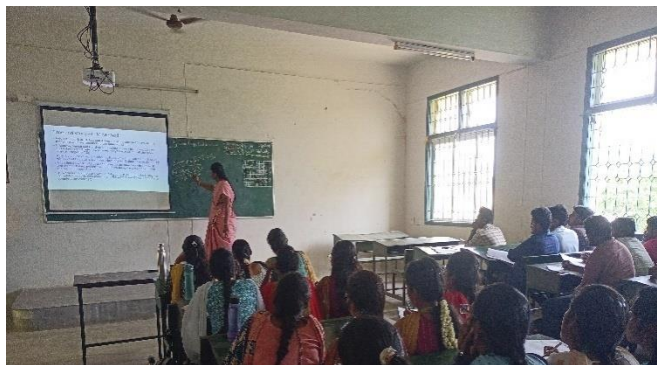
Workshop on "Mastering Aptitude Skills" was organized on 28.08.2024